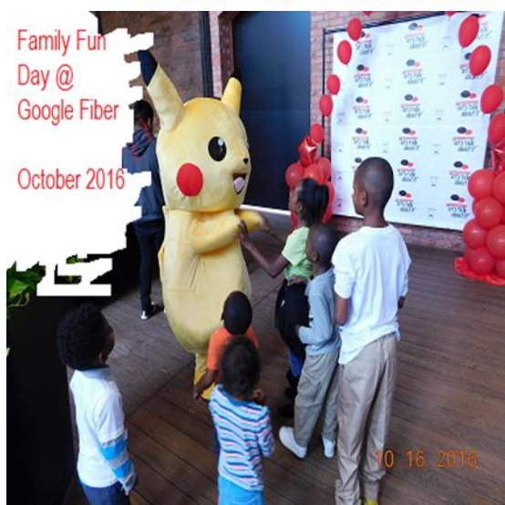
Family Fun Day @ Google Fiber