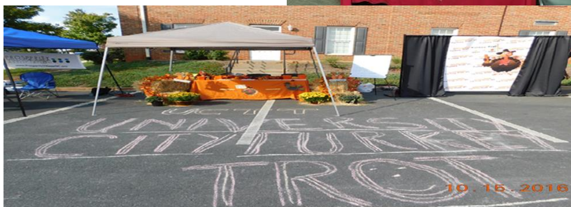
Promoting the University City Turkey Trot (sponsored by SCPOC) at the Prosperity Village Area Association Food Truck Rally in October 2016.