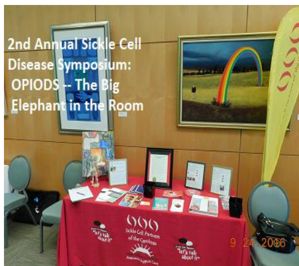
2nd Annual Sickle Cell Disease Symposium: OPIODS -- The Big Elephant in the Room