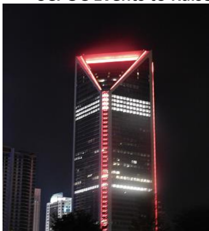
Wells Fargo Red Lights for Sickle Cell Awareness September 2016